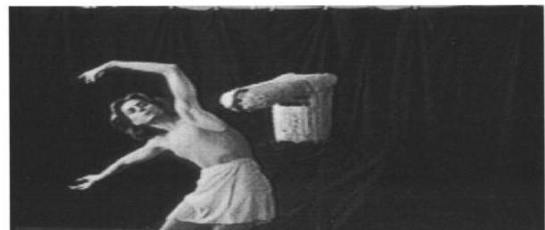
Fig.1 Ballerina dancing with a robot manipulator.

inexpensive consumer electronics products, new types of displays, printers, new ways to store and share information (like electronic paper and “upgradeable” books and maps). New device concepts suitable for large area flexible semiconductor films will lead to new sensors that will find applications in space exploration and defence, specifically in mine detection and active camouflage. An ability of parallel processing of massive amounts of data from millions of sensors will find applications in environmental control and power industry. These areas will be further developed because of the highly interdisciplinary nature of the work on sensitive skin. One of the most powerful abilities of the sensitive skin as applied to motion control is demonstrated in Fig. 1. Here a skin-equipped robot arm manipulator dances with a ballerina. She does not hesitate to turn her back to the “partner,” fully expecting a “human” reaction