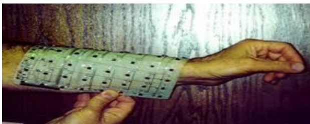
Fig.4 Sensitive skin module: 8 \times 8 = 64 infrared sensor pairs (LED's and detectors); the distance between neighbouring pairs is 25 mm